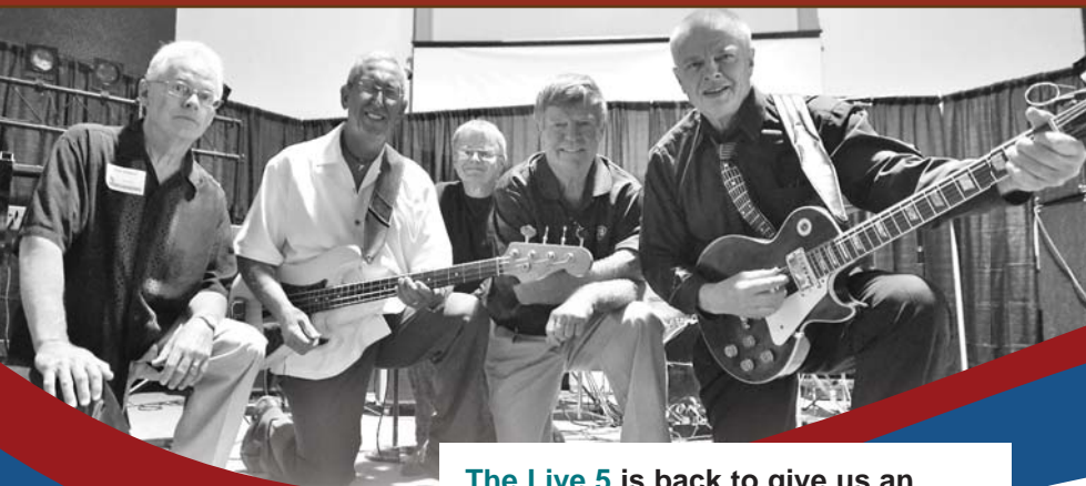
The Live 5 is back to give us an even more amazing show than 2011!